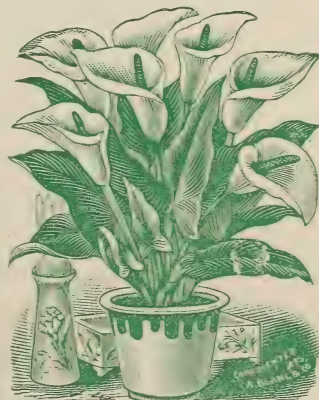
Calla Lily (in full flower).